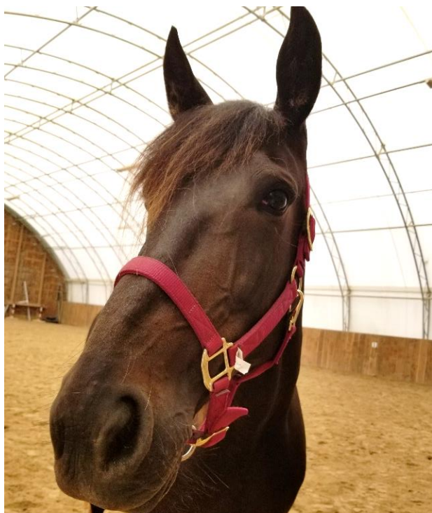
Sammy was just one of the horses clients had the opportunity to bond with at Heartwood.

Our frontline staff work tirelessly to save lives and continue to provide an unparalleled level of compassionate care to all of our clients. It is our hope that by taking care of ourselves, we strengthen our ability to care for the communities around us.